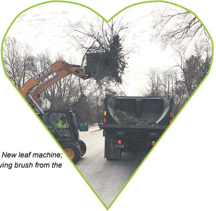
Hard at Work! Left: New leaf machine; Right: Crews removing brush from the winter storms.

O ur Public Works crews have been working tirelessly this winter cleaning up after the recent destructive storms, plowing and salting our streets as well as conducting our usual leaf and brush collection. Under the direction of the new Public Works Director Donnie Scharff, crews have been able to complete leaf and brush collection while effectively managing snow and ice removal and the additional limb collection. Way to go guys!