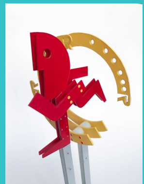
See Red Run!