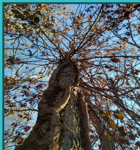
"Wintercreeper Strangling Hackberry"

The fact that Cooper Creek's woodland even exists makes it special. It is a tiny riparian gem in the midst of the metro-wide concrete jungle. But Cooper Creek's riparian ecosystem is unhealthy and under threat for another reason. Invasive wintercreeper and bush honeysuckle have overrun the groundcover and shrub layers of the woodland. They prevent the next generation of trees and other native plants from germinating. Wintercreeper also gradually works its way up the vegetation layers, killing shrubs, midstory trees, and even mature canopy trees by growing up their trunks and slowly strangling them. Over time, without intervention, these invasive plants will destroy the entire ecosystem.