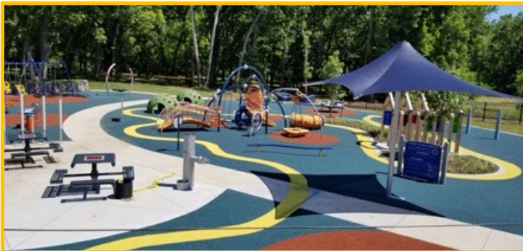
A Unity Surface Playground is one of the objectives in the proposed budget.

in-person attendance to maintain proper distancing. Please keep an eye out on our website and social media for updates. The virtual meeting link can be found on the City's calendar on the homepage of the city's website roelandpark.net .