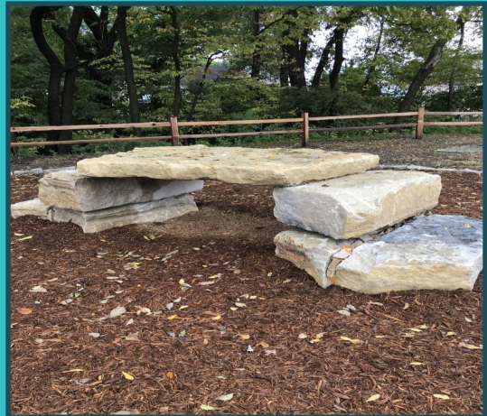
Natural stone play area for kids installed near the picnic table

In the fall of 2022, the eradication of invasive plants will continue with a second treatment. The area will then be reseeded with native grasses and flowering perennials to prevent streambank erosion. 130 native trees and shrubs will be planted to replace the invasives and beautify the creek banks.