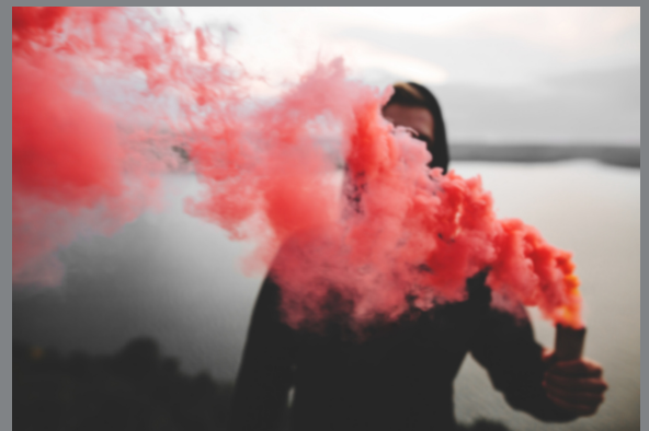
Novelty Smoke Device