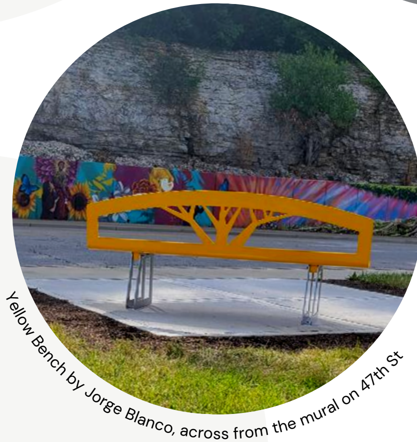
Yellow Bench by Jorge Blanco, across from the mural on 47th St