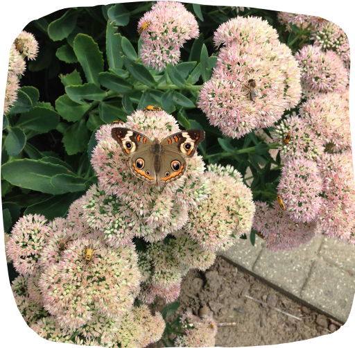
BUCKEYE BUTTERFLY AND BEES ON SEDUM

Restoration of the natural habitat at Cooper Creek Park will intensify during the next few months. Follow-up treatment for the eradication of invasive plant species will target any new growth of bush honeysuckle, wintercreeper vines, and Tree of Heaven. The eradicated areas will then be reseeded with a cover crop mixture of native grasses, which will help prevent erosion.