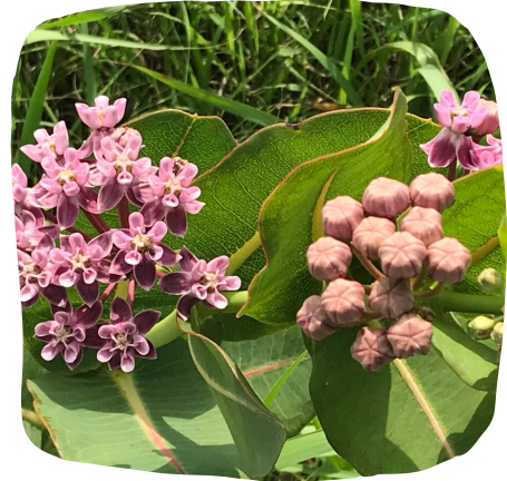
MILKWEED FOR MONARCHS

A diversity of 130 native trees and shrubs will also be planted along the creek banks to reduce erosion and stormwater run-off, beautify the park, and provide shade, air purification, and habitat for wildlife. Because increased diversity provides increased resilience, the restored Cooper Creek ecosystem will have greater ability to withstand threats from extreme weather, insect infestation, disease, pollution, and invasive species. Additional environmental benefits include water filtration, cooler temperatures, and carbon sequestration.