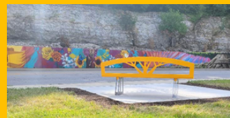
Jorge Blanco, "Yellow Bench" Across from mural on 47th St