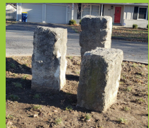
"Prairie Henge Group 1" Cul-de-sac, 47th Ter