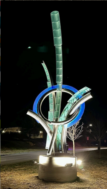
Top photo: Cindy Heller, "Growing Peace Love and Harmony in KC" Roe Blvd in front of the BLVD apartments.