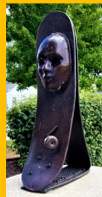
Hugh Merrill, "Surfing 3" 1 of 3, Granada Park