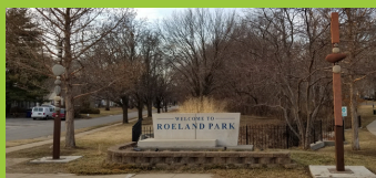
Erie Candee, "River Totem 1 and River Totem 2" Cooper Creek Park