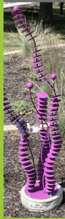
Vadim Kharchenko "Eucalyptus" to be installed at 57th St and Roe Blvd