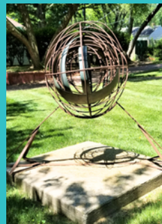
Ian Cochran, "Lines of Corona," Carpenter Park