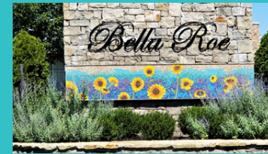
Laura Rendlen, "Sunflowers", Entrance to Bella Roe