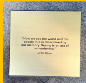
Hugh Merrill, "Surf Project Plaque" Carpenter Park 1 of 10