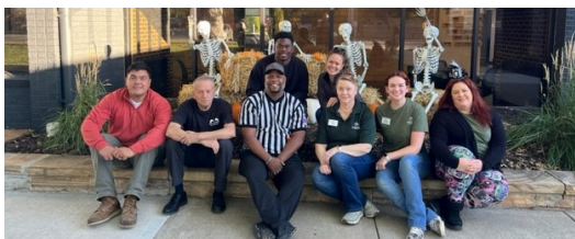
Hard working City & JCPRD Community Center Staff

for construction in 2025 includes renovations to the JCPRD offices, daycare space, workout area, and kitchen improvements. Checkout pg. 6 for more photos of the renovated space.