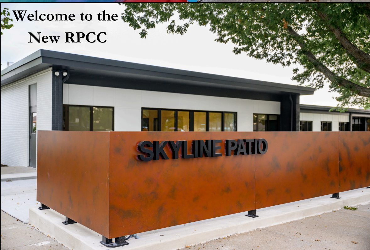
The new Skyline Patio outside the renovated Buena Vista Room

City officials and staff, along with Johnson County Parks & Rec leadership, held a ribbon cutting and Trunk or Treat on October 21st to mark the completion of major renovations at the Roeland Park Community Center. Improvements include new flooring and paint throughout the facility, new lighting, new doors and interior finishes, and a new patio outside of the Buena Vista Room. This completes phase 1 of renovations for the community center. Phase 2 which is planned