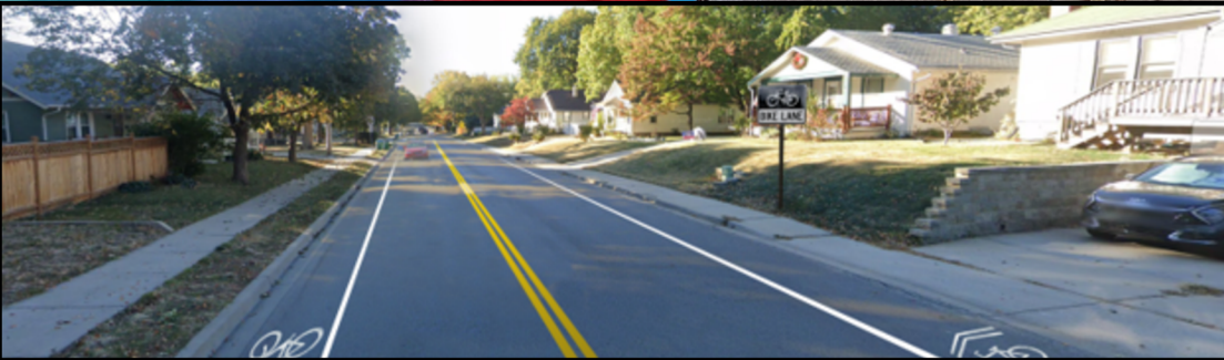
Painted bike lanes are coming to Mission Road

Official Newsletter of the City of Roeland Park