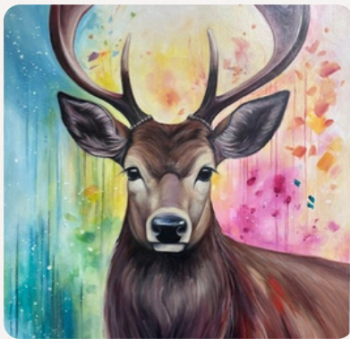
"Silent Majesty" - Brittnee Wood