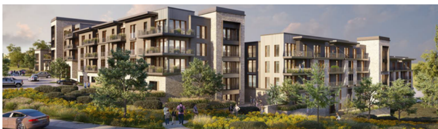
Rendering of "The Rocks" Mixed Use Apartments and Restaurant